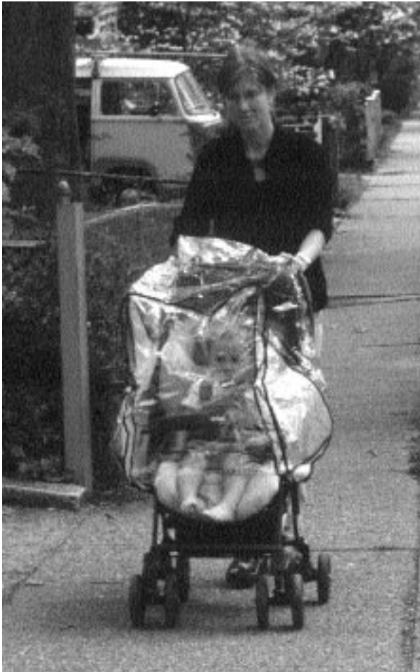
This Graco stroller raincover contains DEHP, a phthalate that some manufacturers have voluntarily removed from their products.

PVC's need for chemical additives is only part of its hazard - its lifecycle has serious, negative consequences. Dioxin is a confirmed human carcinogen (cancer-causing substance), and one of the most potent toxins known to man. Together, PVC manufacture and disposal represent one of the largest sources of dioxin. For these reasons, Greenpeace advocates the phase-out of all PVC plastics.