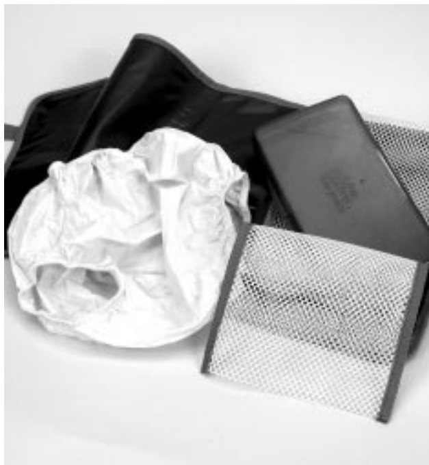
This Gerber diaper cover and The First Years changing mat contained significant levels of one phthalate, DINP. In addition, the changing mat contained organotins and bisphenol A.

Phthalate plasticizers are only one class of additives that PVC requires. Without additives, PVC is not only brittle but it is also relatively unstable. Stabilizers, often metals, are added to PVC to keep it from breaking down and to give it stability against heat. (DiGangi 1997) Lead and cadmium were widely used for these purposes, but regulations brought on by their known human health hazards have forced manufacturers to replace them with other metals in some products. Organotins have long been used in commerce (Sadiki 1996) and as such, they made attractive candidates for replacements of the known hazardous stabilizers. However, the increased use of organotins as PVC stabilizers does not mean that they have a 'clean bill of health.' In fact, evidence is mounting against them. In the face of emerging reports that organotins also leach from PVC (Sadiki 1999) and are hazardous to humans (Boyer 1989, Champ 2000, ASTDR 1992), Greenpeace also tested the products included in this study for their organotin content. We did not test the leaching of either phthalates or organotins from PVC since it is already established to occur. (Cadogan 1993, Sadiki 1999) Furthermore, leaching rates are dependent upon a variety of factors such as heat, age of the product and friction. (DiGangi 1997)