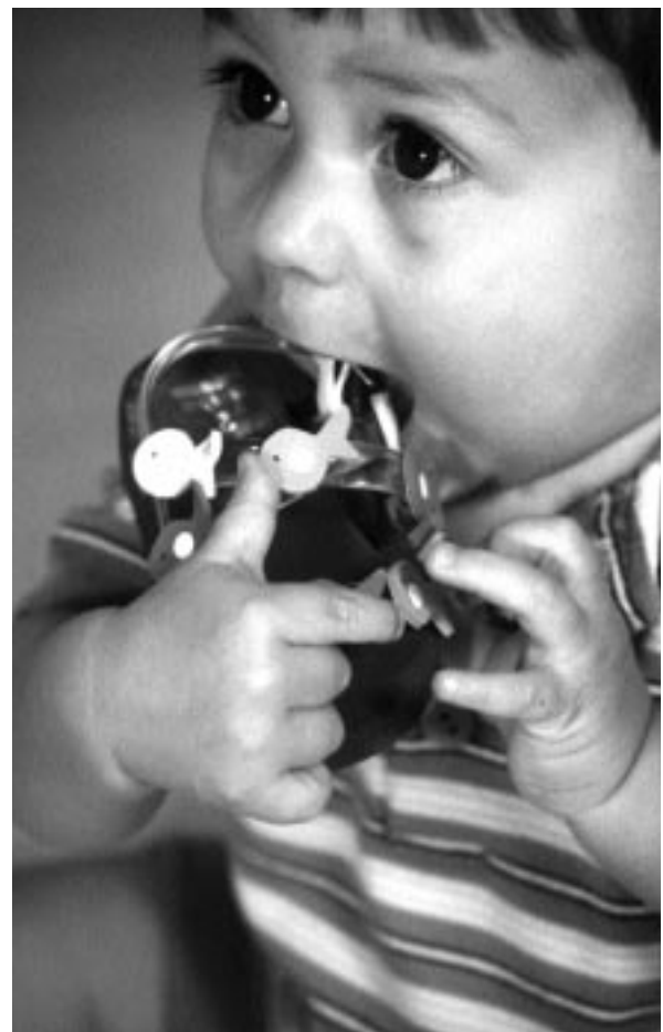
Small children chew on everything. It is part of their learning process!

1993) That is to say, DEHP may reasonably be considered a cancer causing substance in humans. A retrospective study conducted in Sweden found an increase in testicular cancer in workers who were exposed to PVC (Ohlson 2000), although additional studies are needed to determine whether phthalates are responsible.