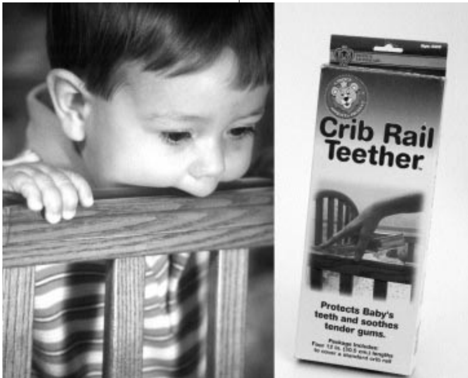
This Prince Lionheart crib rail teether contained over 20% phthalates.